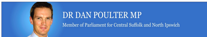
DR DAN POULTER MP

Member of Parliament for Central Suffolk and North Ipswich