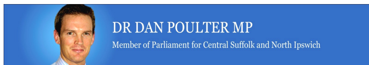
DR DAN POULTER MP

Member of Parliament for Central Suffolk and North Ipswich