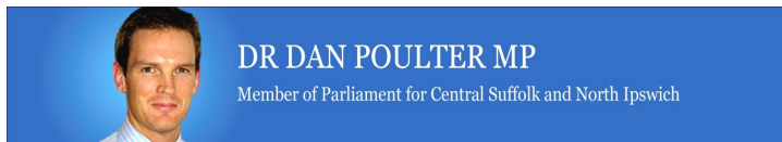
DR DAN POULTER MP

Member of Parliament for Central Suffolk and North Ipswich