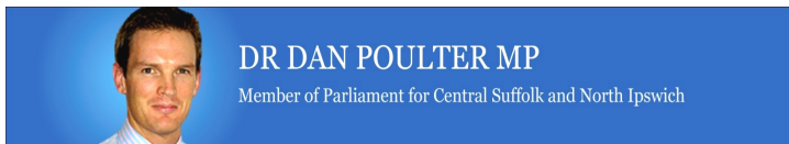
DR DAN POULTER MP

Member of Parliament for Central Suffolk and North Ipswich