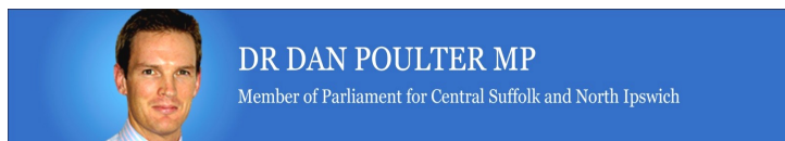
DR DAN POULTER MP

Member of Parliament for Central Suffolk and North Ipswich