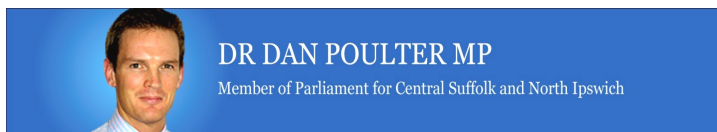
DR DAN POULTER MP Member of Parliament for Central Suffolk and North Ipswich

We are rightly proud of the contribution that Suffolk is making to deliver clean and green energy as we have become a magnet for renewable energy production. Suffolk offers one of driest climates in England with longer hours of daily sunshine and miles of coastline, so it is seen as the perfect location for solar energy and of course, offshore wind. Most of us will recognise and celebrate the benefits that renewable energy can bring, including much needed jobs for local people, as well as helping us to achieve our net zero carbon emission targets. However, these large scale energy projects cannot continue to be brought about in a piecemeal fashion without proper consideration for the potential consequences to some of our local communities.