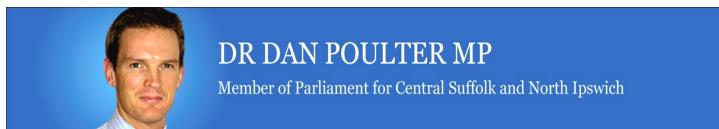
DR DAN POULTER MP

Member of Parliament for Central Suffolk and North Ipswich