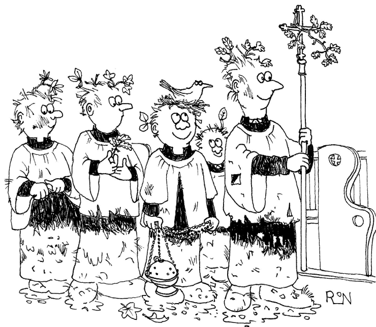
The procession had taken the scenic route