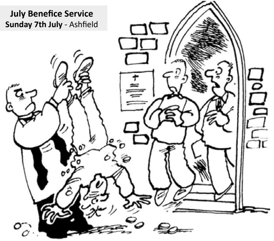
...well you cannot the fault the efficacy of the new 'Planned Giving' scheme