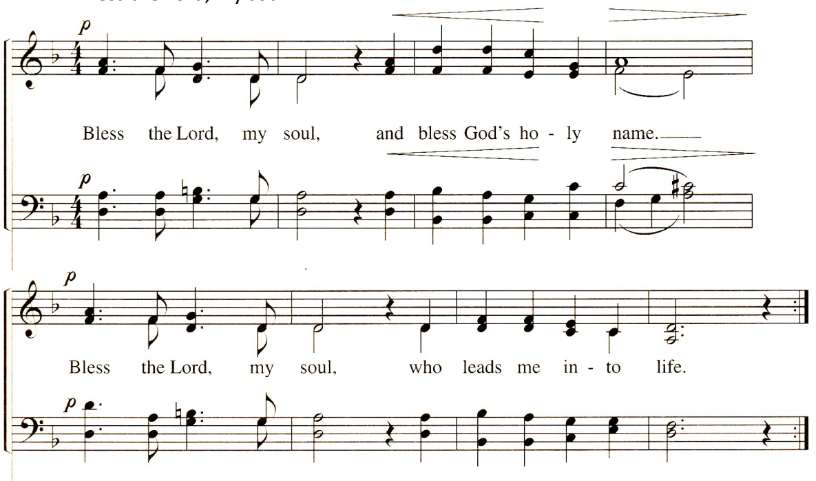
CHANT 1. Bless the Lord, my soul

For blessings of creation, we give you thanks, O God. For blessings of friendship, we give you thanks, O God. For blessings of healing, we give you thanks, O God. (pause)