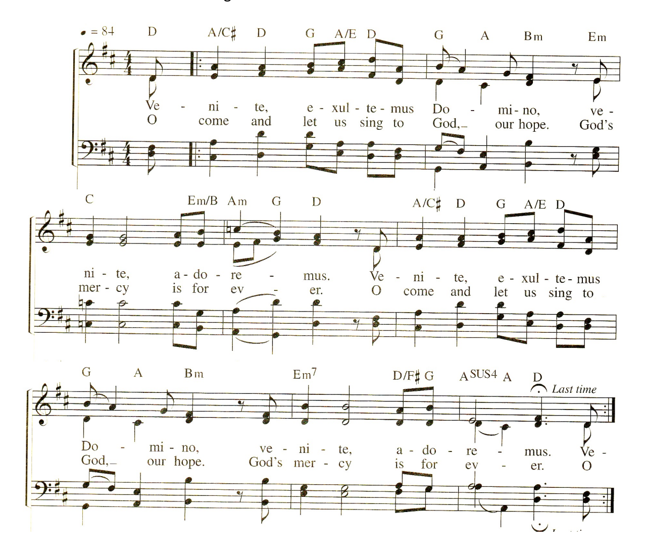
CHANT 4 O come and let us sing to God