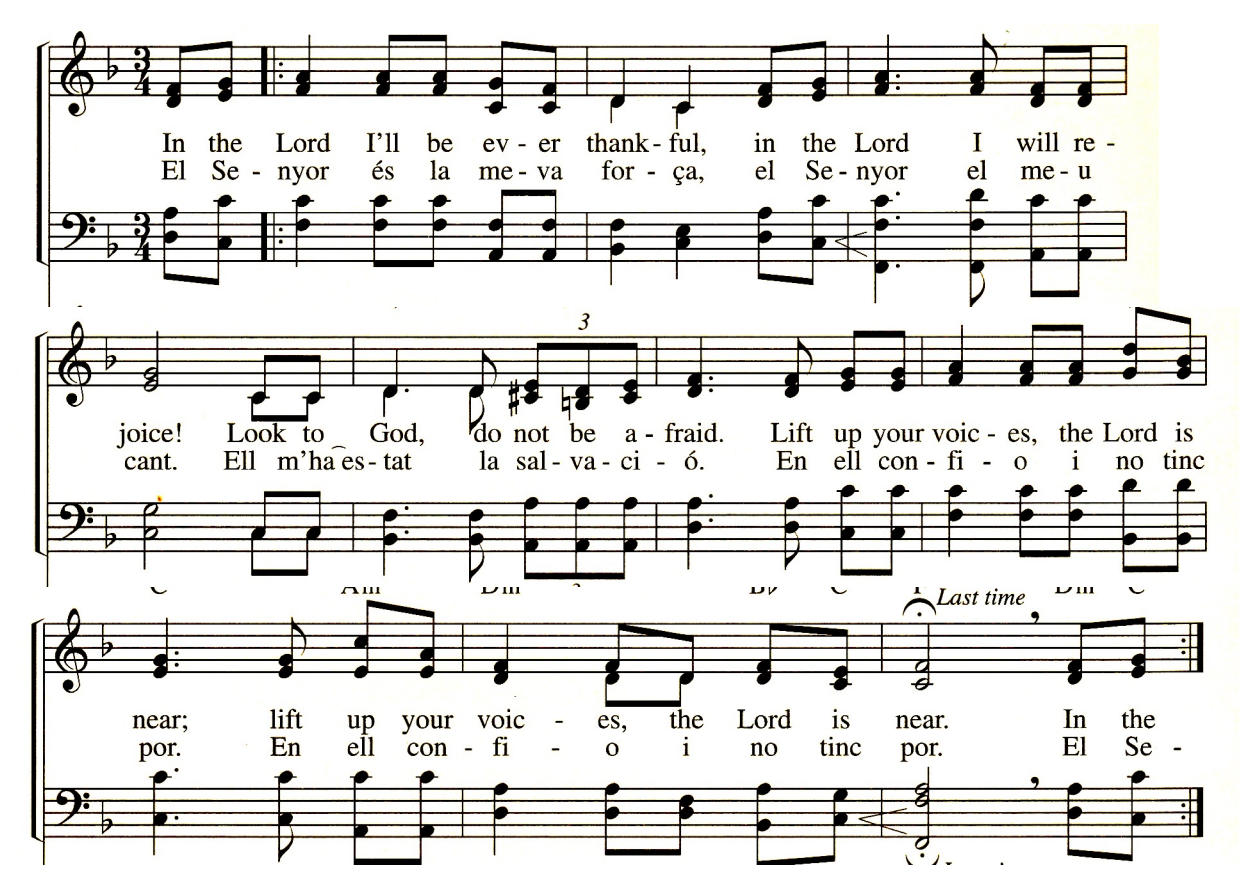
CHANT 3. In the Lord I'll be ever thankful

For thine is the kingdom, the power and the glory, for ever and ever. Amen